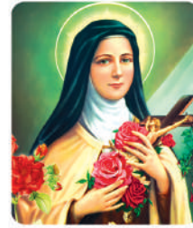
Our Heavenly Patroness St Little Flower

into self-reliant, responsible, morally upright, and socially committed citizens.